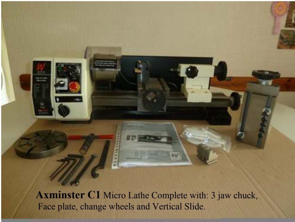
Axminster C1 Micro Lathe Complete with: 3 jaw chuck, Face plate, change wheels and Vertical Slide.